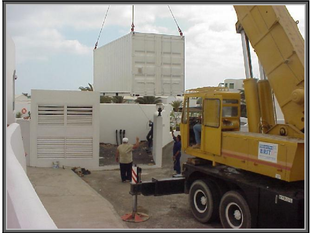
Friday, August 3, 2001 – 8:30 AM