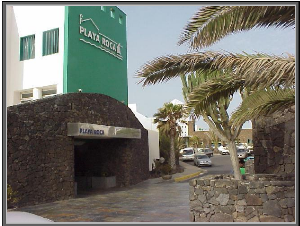
Hotel Playa Roca Island of Lanzarote