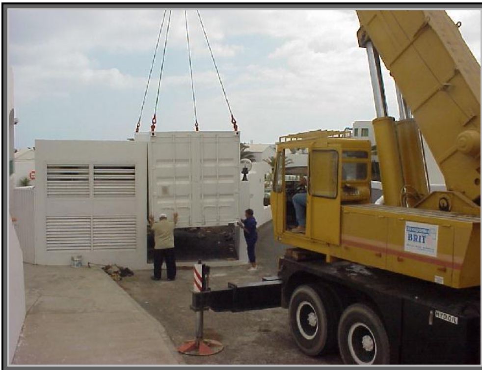
Container plant installed at location ready for commissioning.