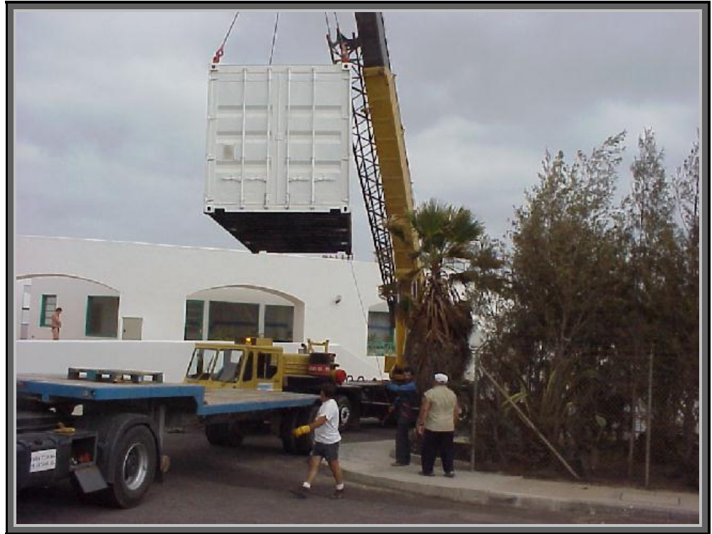
Friday, August 3, 2001 – 8:15 AM